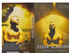
‘FOUR SEASONS’ (2005)